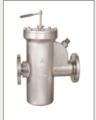
FOR MEDIUM VISCOSITY LIQUIDS